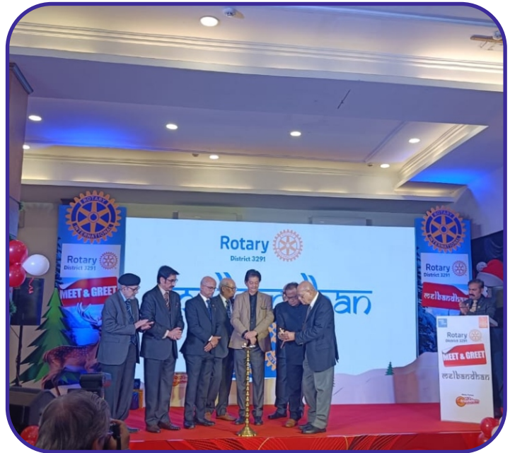
MEET AND GREET 2026-27 LIGHTING OF THE LAMP