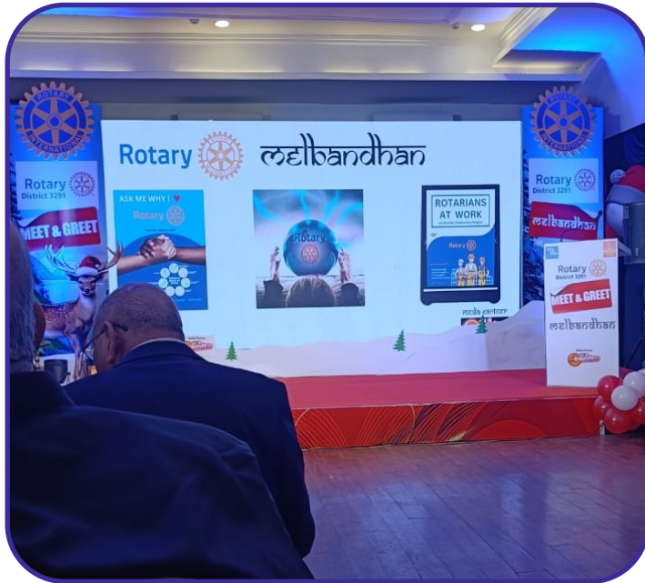
MEET AND GREET 2026-27 A GLIMPSE